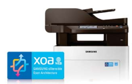
*Supports SL-C3060FR onl

Get connected to printing solutions with the XOA-Web. The fast and easy integration of solutions will help your business run more efficiently and smoothly.