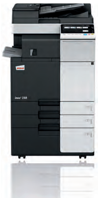
ineo+ 258 fitted with inner finisher

The future is mobile. Mobile working habits are becoming increasingly common in office environments. Smartphones and tablets have enabled new ways of working, yet numerous documents still need printing or scanning. In many companies this is only possible on a desktop PC, which forces mobile workers into a time consuming and inconvenient detour instead of printing or scanning directly from their mobile device. To solve this problem, DEVELOP brings you the ineo+ 368 Series, a colour office system equipped to fully support mobile working habits.