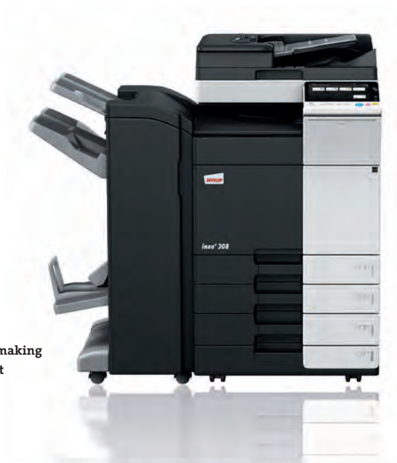
ineo+ 308 fitted with booklet-making finisher and 4-tray paper input