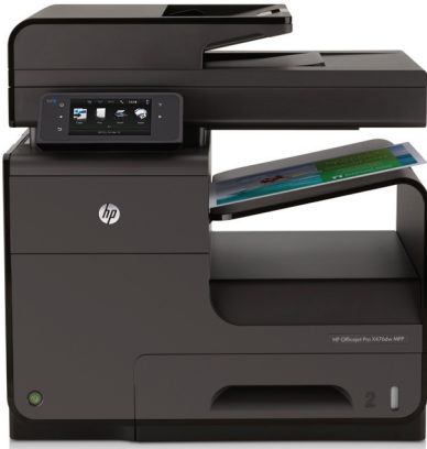
HP Officejet Pro X476dw