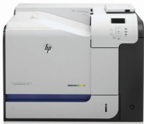
HP LaserJet Enterprise 500 color M551dn