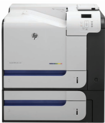
HP LaserJet Enterprise 500 color M551xh