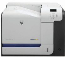
HP LaserJet Enterprise 500 color M551n