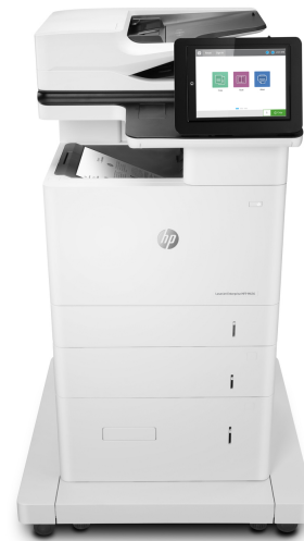
HP LaserJet Enterprise MFP M636fh

Dynamic security enabled printer. Only intended to be used with cartridges using an HP original chip. Cartridges using a non-HP chip may not work, and those that work today may not work in the future. Learn more at: http://www.hp.com/go/learnaboutsupplies