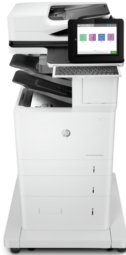
HP LaserJet Enterprise Flow MFP M636z

This HP LaserJet MFP with JetIntelligence combines exceptional performance and energy efficiency with professional-quality documents right when you need them – all while protecting your network from attacks with the industry's deepest security. 1