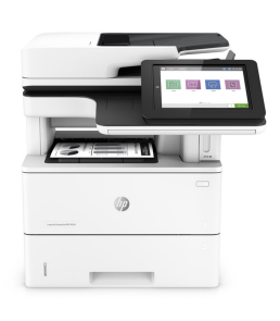
HP LaserJet Enterprise MFP M528f