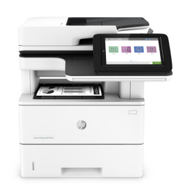
HP LaserJet Enterprise MFP M528dn

Choose an HP LaserJet Enterprise MFP designed to handle business solutions securely and efficiently, and helps conserve energy with HP EcoSmart black toner. Keep up with the demands of growing business with a printer you can rely on.