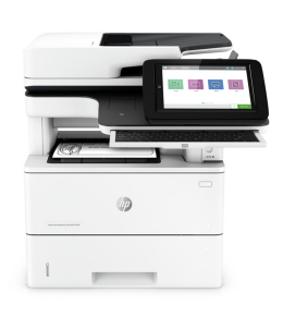
HP LaserJet Enterprise Flow MFP M528z